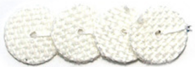
White Linen Fabric